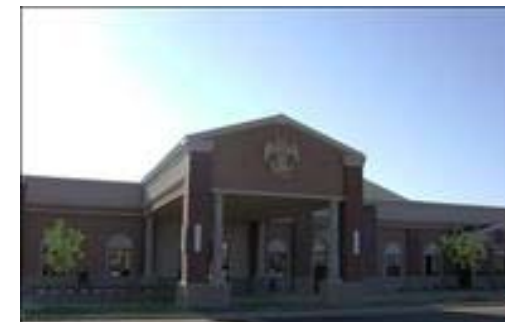
View of West Entrance – Scottish Rite Temple (Learning Center)