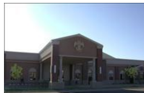
View of West Entrance – Scottish Rite Temple (Learning Center)